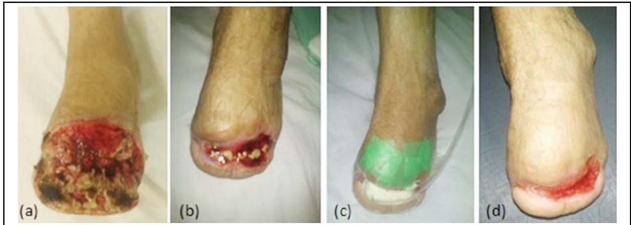
Fig.2: Forty year old male with transmetatarsal amputation. (a) Necrotic slough in wound. (b) Wound size decreased with little amount of slough. (c) Vacuum dressing applied. (d) Wound contracted and near to heal.