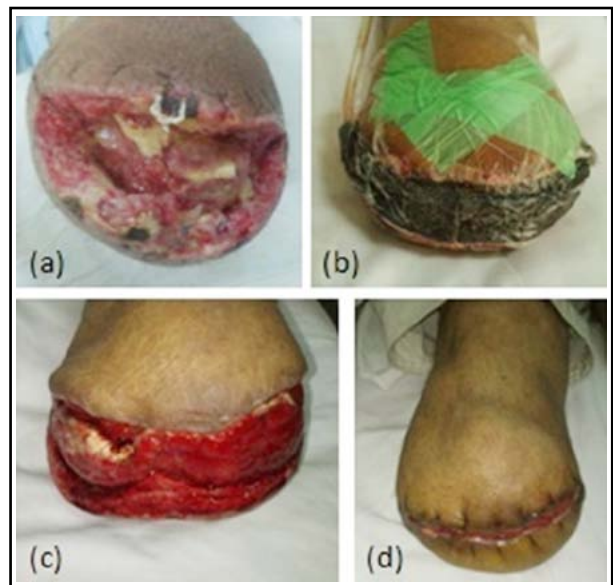
Fig.3: Fifty six year old male with below knee amputation. (a) Infected stump. (b) Vacuum dressing applied after debridement. (c) Healthy wound. (d) Secondary closure.

Negative pressure vacuum dressing have been utilized in the management of complex wounds. 10,11 Continuous or intermittent suction keep the wound clear of exudate, persistence of which may be a good medium for bacterial growth and thus decreases the bacterial count. It also enhances the blood