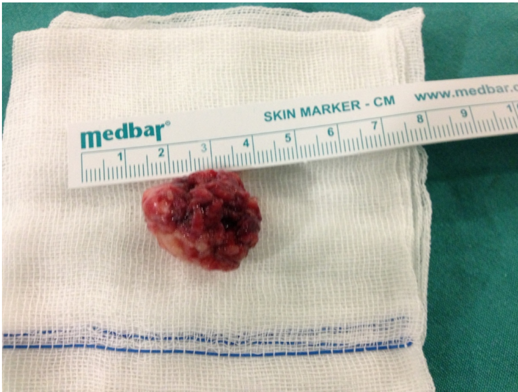
Fig. 2. Gross appearance of the tumor