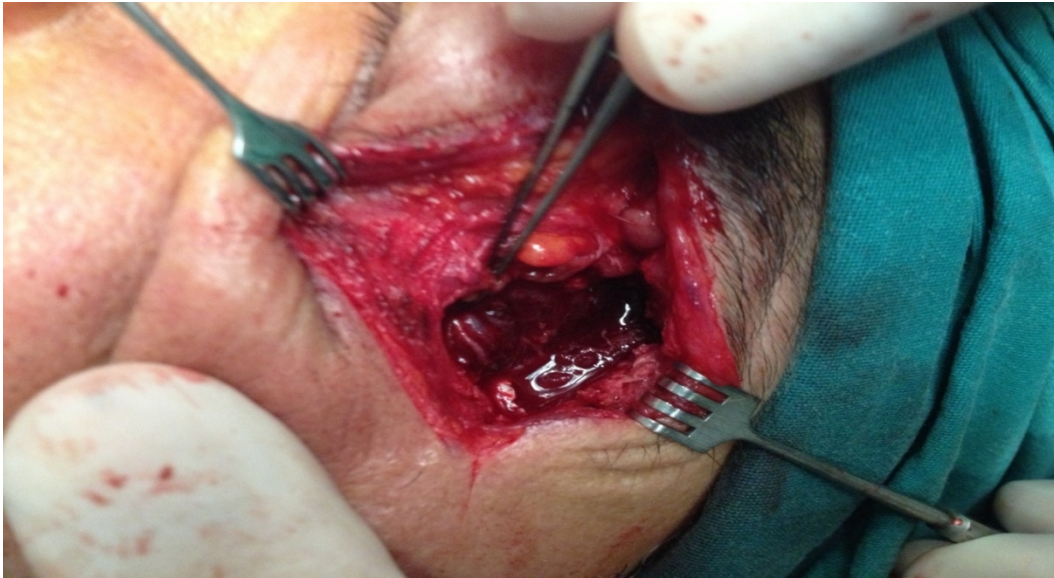
Fig. 1. Gross appearance of the mass, The tumor appeared lobulated with a smooth capsule