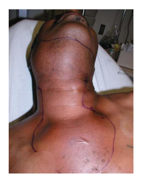
Fig. 1. Extensive neck and submandibular swelling secondary to Ludwig's angina

Patients with Ludwig's angina commonly present with unilateral or bilateral neck swelling, pain, dysphagia, tongue enlargement, drooling and trismus. Features of systemic illness, e.g. fever, malaise, rigors may also occur. As the infection worsens and airway compromise develops, the patient will show signs of respiratory distress. If allowed to progress, the infection may spread into the bones leading to osteomyelitis. Cases of Ludwig's angina complicated by necrotising fasciitis have also been reported [6]. Examination findings include tenderness and swelling of the tongue, neck and submandibular areas, lymphadenopathy, tachypnoea and stridor. These features are illustrated in Fig. 1.