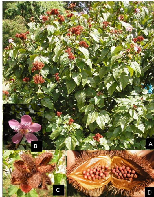
Fig. 1. Annatto yielding Bixa orellana plant. A: Whole plant; B: Flower; C: Fruit bunch; D: Dehiscenced fruit with Bixa seeds