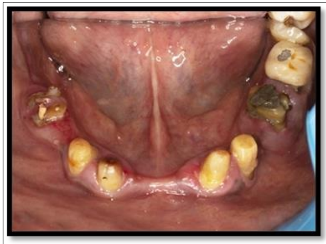
Fig. 1. Pre-operative intraoral occlusal view of mandibular teeth

found that there was a splinted mandibular bridge extending from tooth #36 to #46 (FDI tooth numbering system). The bridge was ill-fitting with food lodgment in the posterior regions and mobile at #46 region. The region of #34 presented with tenderness on percussion. (Fig. 1) The remaining maxillary teeth were sound. The patient was subjected to panoramic radiography (OPG) and cone-beam computed tomography (CBCT) that demonstrated periapical infection with respect to #34, periodontitis in #46, missing teeth #31,32,42,42,35,45; secondary caries in #36 and bilateral impacted second premolars. (Fig. 2) The radiographs also revealed resorption of the alveolar bone, a residual bone height at #45 region being 10mm; #47 being 6mm; #36 being 9mm with minimal residual bone between impacted premolar and adjacent teeth.