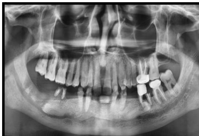
Fig. 2. Pre-operative radiograph