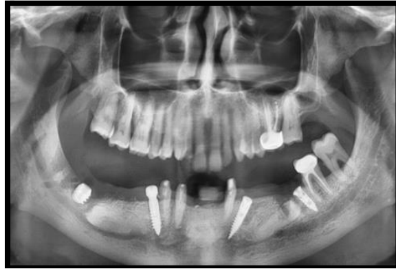
Fig. 5. Radiographic view of the implants placed