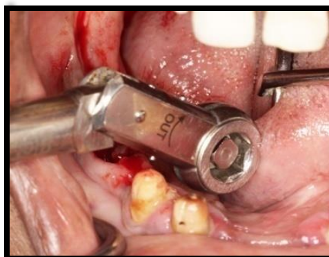
Fig. 4. High torques achieved with immediate implant placement