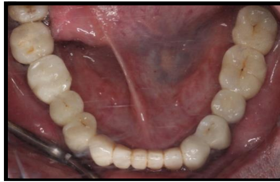
Fig. 6. Screw retained metal ceramic definitive prosthesis