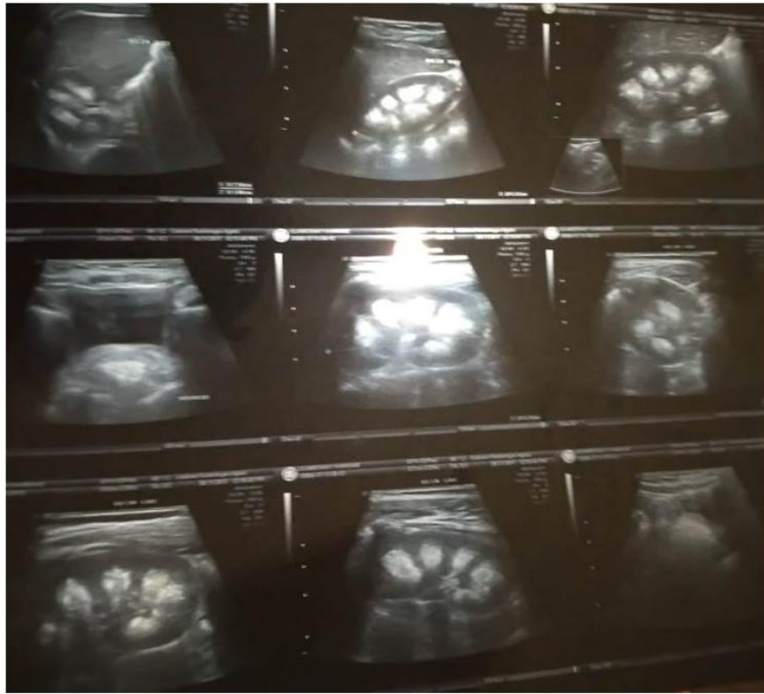
Fig. 2. KE Kidney ultrasound: nephrocalcinosis