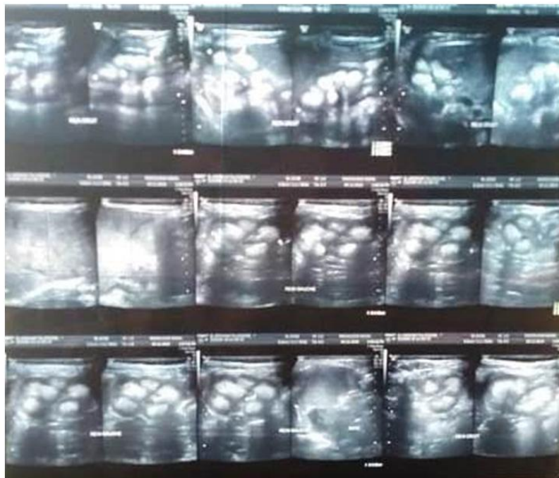
Fig. 3. KE Kidney ultrasound: nephrocalcinosis