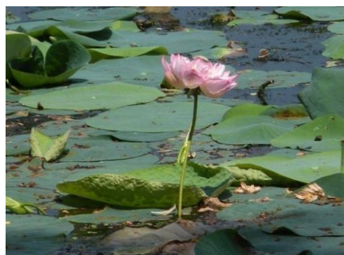
Fig. 2. Kamal