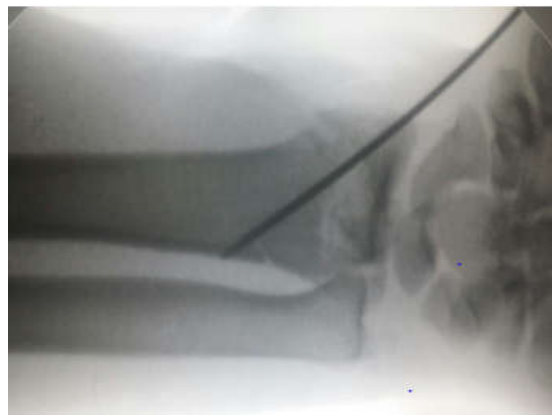
Fig. 3. Preliminary fixation of large articular fragments