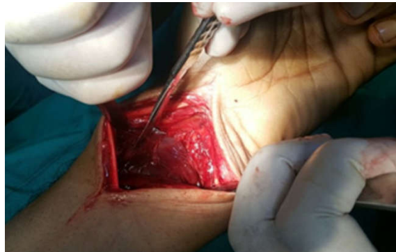
Fig. 2. Pronator quadratus exposed and an I-shaped incision is made to elevate it