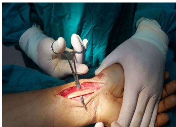
Fig. 1. Flexor carpi radialis tendon after sheath release

After exposure and debridement of the fracture site, the fracture was reduced and provisionally fixed under C-Arm using k-wires. Extra articular fractures were reduced by simple traction and slight palmar flexion of the wrist and manual manipulation. In intra articular fractures large fragments were be manipulated, reduced and preliminary fixed by wires (Fig. 3).