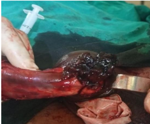
Fig. 2. Haematoma at the site of penile injury

A size 18 Foleys catheter was passed into the bladder revealing a concomitant transverse urethral tear of about 0.5cm (Fig. 4). The tunica albuginea and the urethral tears were repaired with 3/0 vicryl sutures.