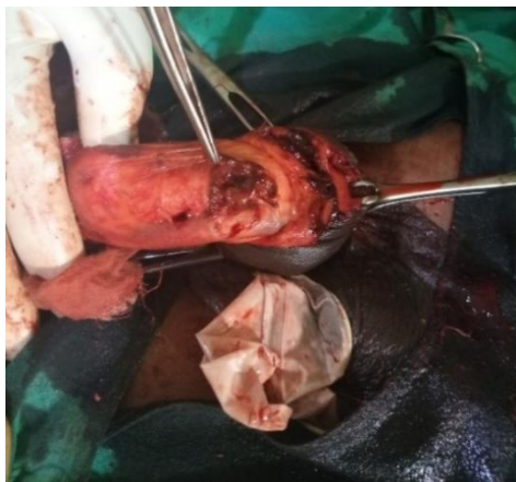
Fig. 3. Defect after the evacuation of haematoma

For leakage control, artificial erection was provided by saline injected into the right corpus cavernosum. The patient had an uneventful postoperative recovery. Urethral catheter was removed on postoperative day seven and the patient was discharged on oral antibiotic treatment. He was advised to abstain from sexual intercourse for at least 4 weeks.