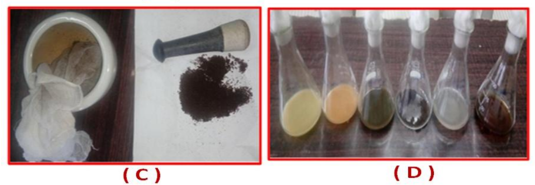
Fig. 2. Preparation of botanicals

A: Preparation of Mentha arvensis extract; B: Preparation of Allium cepa extract C: Preparation of Neem seed kernel extract; D: Different botanicals prepared