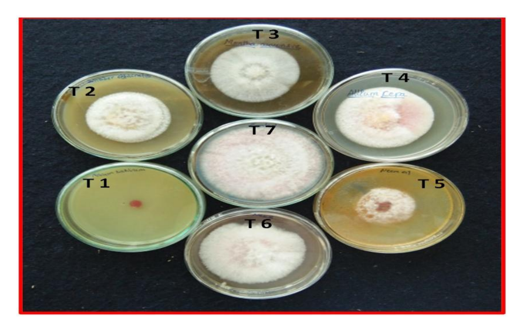
Fig. 1. Efficacy of botanicals against F. oxysporum f. sp corianderi T1: Allium sativum, T2: Zingiber officinalis, T3: Mentha arvensis, T4: Allium cepa, T5 : Neem oil T6 : NSKE, T7 : Control