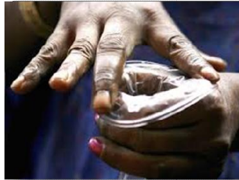
Fig. 3. A health worker displaying how a female condom is used

The female condom largely evoked feelings of anxiety and frustration ; it generally came across as extremely unpopular and not user-friendly while the implant was reported to cause severe bleeding as shown below: