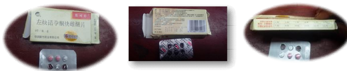
Figs. 4, 5 and 6. The contraceptive pill found in use by a woman in Wakiso district

The main service providers and partners or actors in ensuring access to and utilisation of LSC across the country were cited as Marie Stopes, Pace, Star EC, Red Cross, TASO, IDI, ACCORD, Plan Uganda, World Vision, Uganda IRS project, Frama, UNICEF and Malaria Consortium as shown in Table 7.