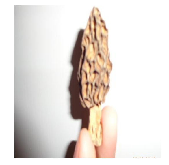
Fig. 1. A Morchella conica

Morchella conica is a macro fungal species that belongs to genus Morchella and family Morchelleceae [7]. Mushrooms or morels are used by the people because of their supreme taste and highly antioxidant activity. These are normally grown in temperate areas of the world. In Pakistan it is found in regions including Swat valley and Hindu Kush Mountains. Morchella conica mostly grows in Pine Hills under pine trees and makes 48% of the total morels collection of Swat [8].