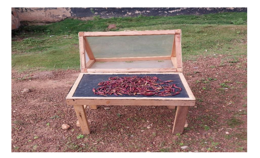
Fig. 2. Solar dryer