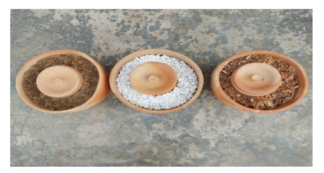
Fig. 3. Zeer pot refrigerators with different lining media

Asamani et al.; Eur. J. Nutr. Food. Saf., vol. 16, no. 4, pp. 139-150, 2024; Article no.EJNFS.115439