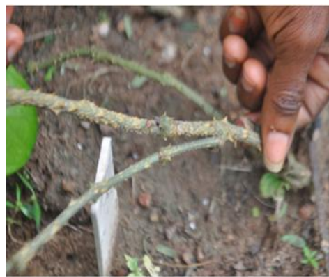
MATURE STEM SPINES AT STEM BASE