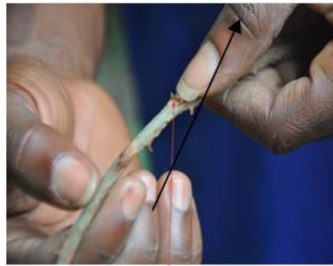
MATURE STEM OF COALESCENT SPINE