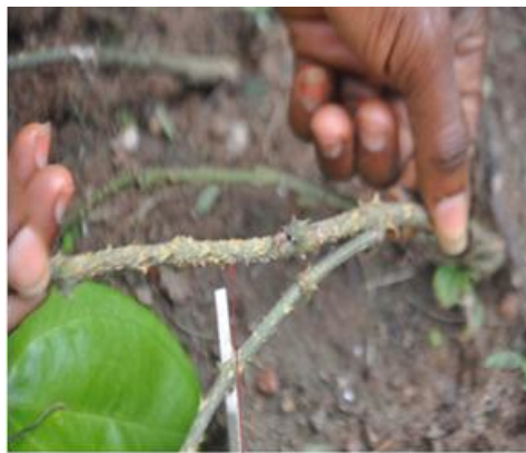
BARKY PATCHES (RACHIS)

Means and standard deviations were estimated using the formula described by Gomez and Gomez [15], Analysis of variance (ANOVA) was used to test for significant differences Duncan Multiple Range Test (DMRT) was used separate the means at significance level of p < 0.05 . Dendrogram was constructed to show the cluster pattern of accessions with similar characteristic. Principal component analysis (PCA) and correlation coefficient were also determined to establish the relationships between the characters and accessions.