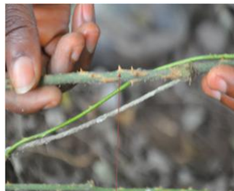
MATURE STEM-COLOUR OF SPOT AT SPINE BASE