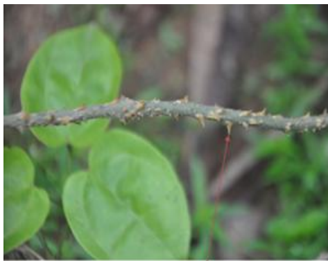
MATURE STEM SPINE ABOVE BASE