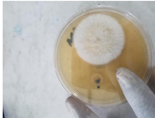
Plate 2. Pure culture of Mucor heimalis