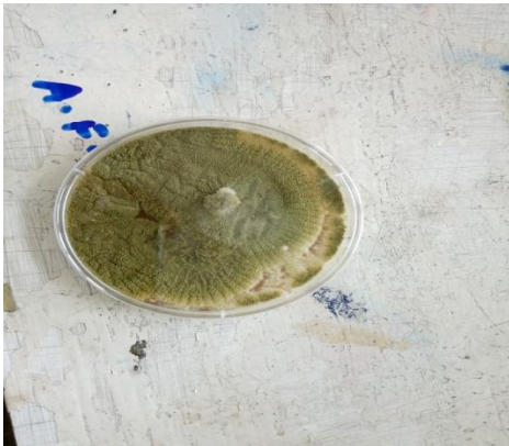
Plate 3. Pure culture of Aspergillus flavus