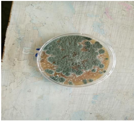
Plate 1. Pure culture of Penicillium notatum