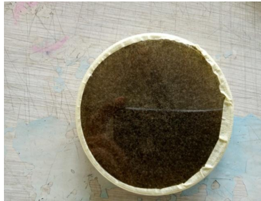
Plate 4. Pure culture of Rhizopus stolonifera