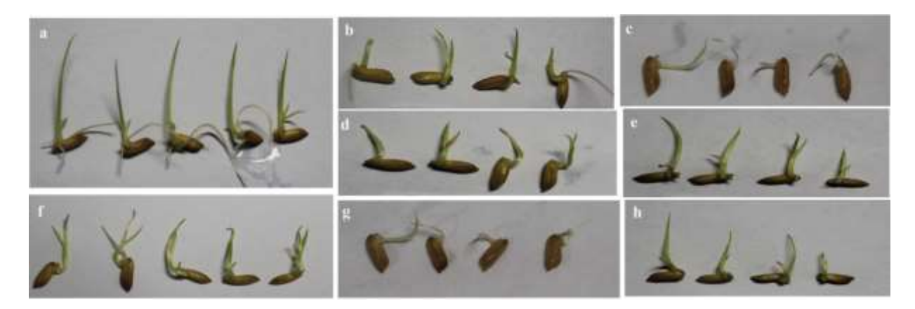
Figure 1. Effect of crude ustiloxins on the germ and radicle of '9311'. a. CK; b. UvZZ9-1; c. UvQL3-2; d. UvPJ1-1; e. UvWJ2-1; f. UvMY1-1; g. UvJT6-1; h. UvYA1-2.