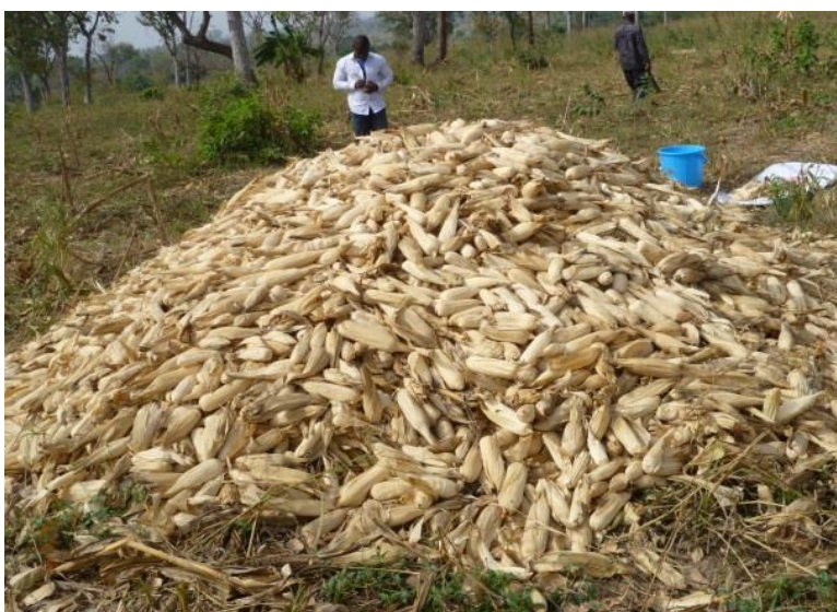
Figure 3. Heaped maize cobs on the field waiting for shelling.

LOD= limit of detection (G2, G1= 1.5ng/g; B2, B1= 0.8ng/g). R^2 = 0.974 . Maximum limit for safe consumption of aflatoxin contaminated maize is 20ng/g (FDA, 2011). AG 1,2,3 and EJ 1,2,3 represents composite maize samples from the three clusters zones at Agboblshie and Ejura markets respectively.