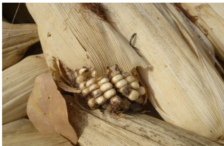
Figure 4. An infested cob among heaped cobs on the field.